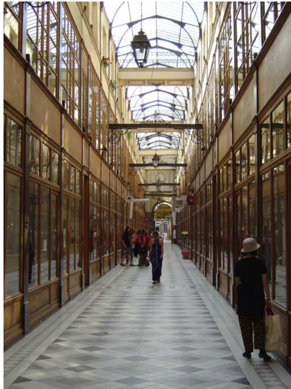
One of the arcades in Paris, described in the Arcades Project by Walter Benjamin

of a city just as much as one who, even if inspired by an altruistic vision, tries to force changes on an urban populace. Similarly detrimental is the developer who looks only to profit or the architect whose motive is simply to gain notoriety by creating startling edifices. Just as most doctors have internalized a code of medical ethics, urban professionals should embrace city-friendly principles. This paper has tried to identify a possible list of such principles.